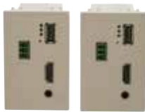
HDBaseT™ Module IMHDBT3OW