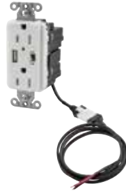
AV Power Source AVPS15W